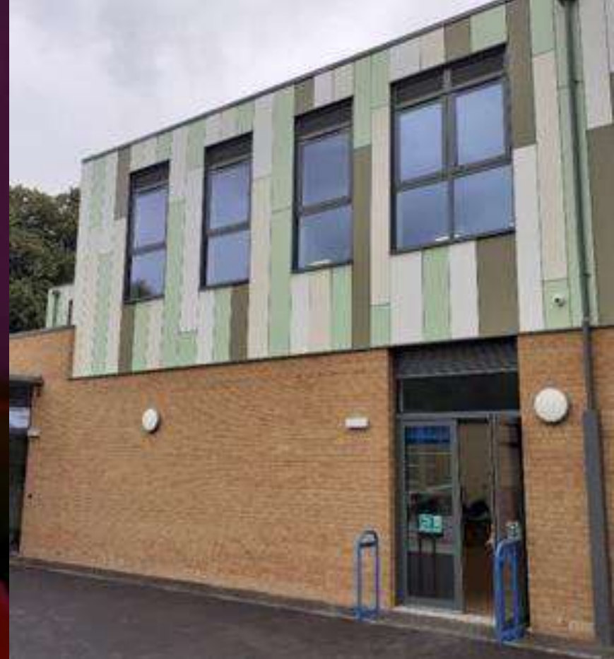
Spilsby The Eresby School