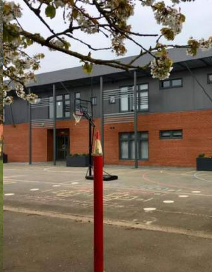
Grantham Ambergate College & The Sandon School