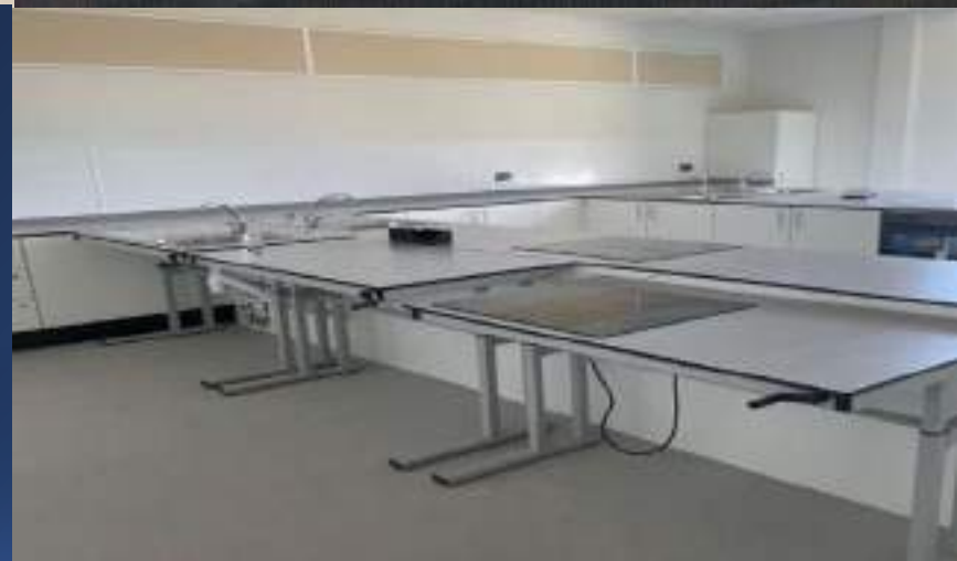
Boston Endeavour Academy