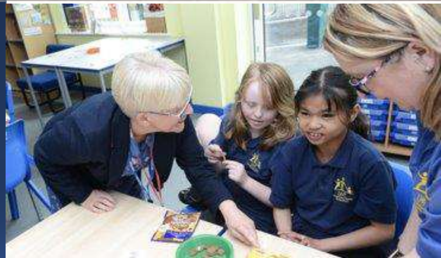
Louth St Bernard's School