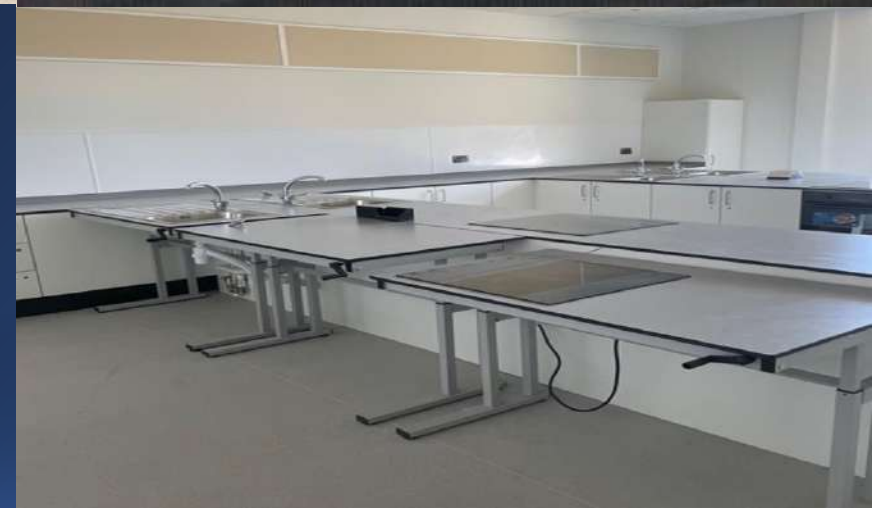
Boston Endeavour Academy