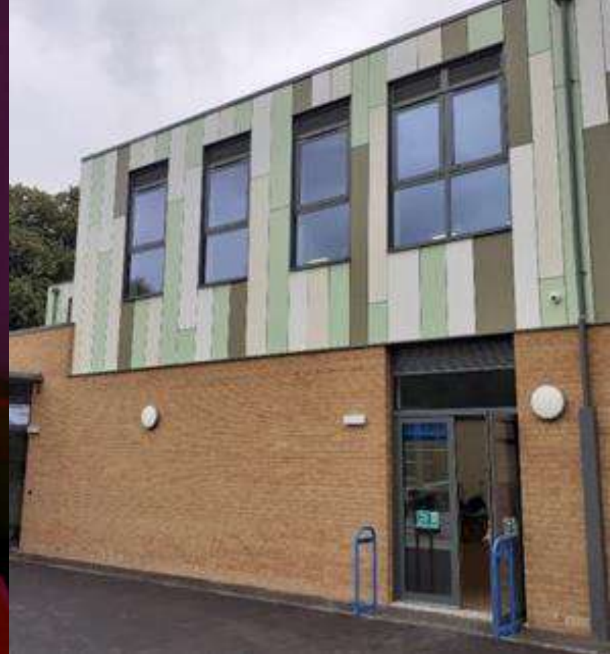
Spilsby The Eresby School