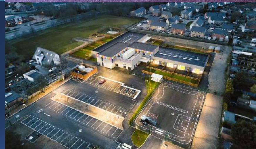
St Christopher's Primary School