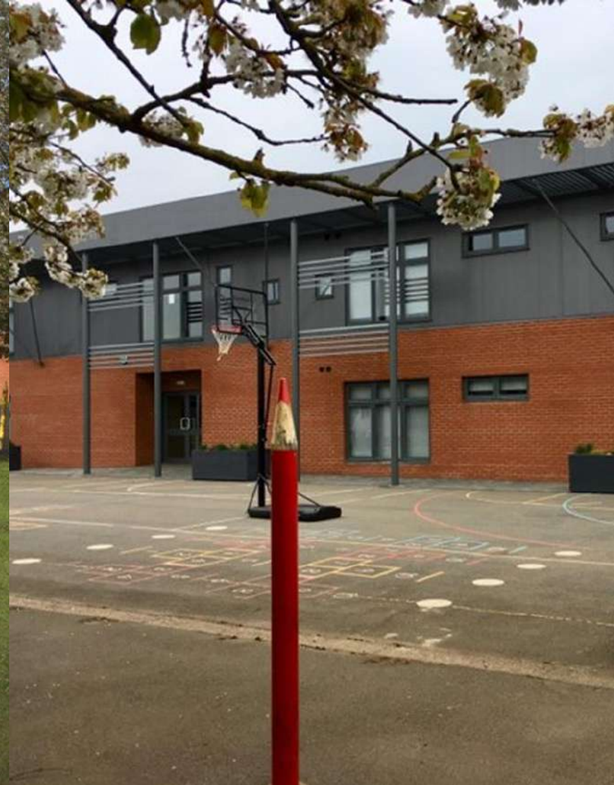
Grantham Ambergate College & The Sandon School